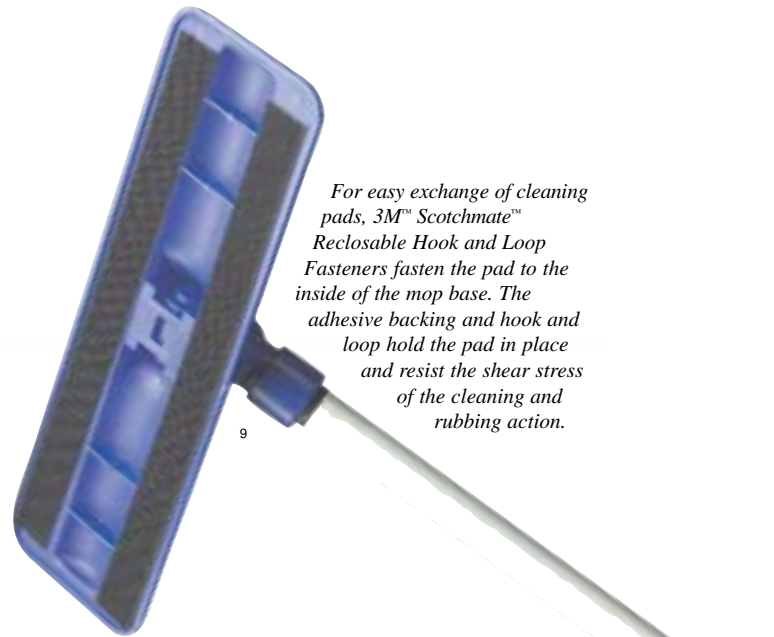
For easy exchange of cleaning pads, 3M™ Scotchmate™ Reclosable Hook and Loop Fasteners fasten the pad to the inside of the mop base. The adhesive backing and hook and loop hold the pad in place and resist the shear stress of the cleaning and rubbing action.

Now it's easier than ever to get connected – www.3M.com/fasteners . Or 1-800-362-3550 for additional information or sales assistance.