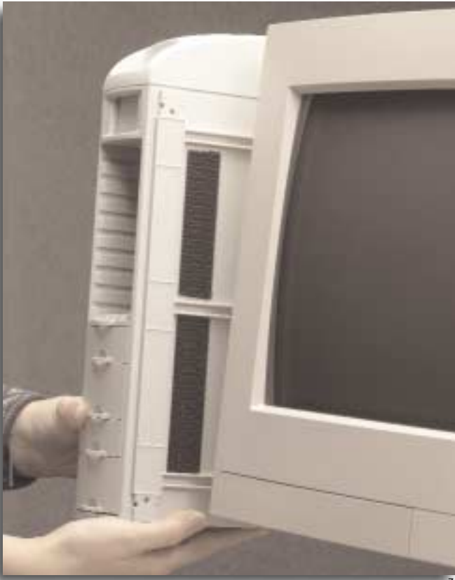
Removable plastic storage box for computer media attaches to the side of the CRT screen with strips of 3M™ Dual Lock™ Reclosable Fastener. 3M pressure sensitive adhesive backing bonds to many plastics on contact.