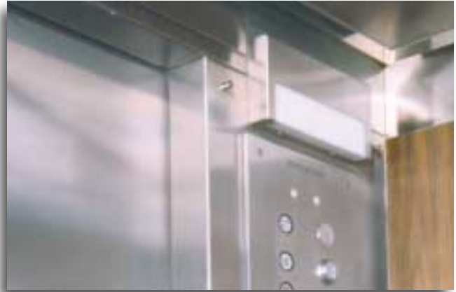
Decorative acoustic panels in an elevator are held invisibly in place with 3M™ Dual Lock™ Reclosable Fasteners.