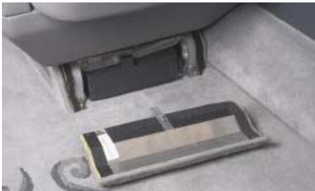
In and around seating, 3M™ Flame Resistant Scotchmate™ Reclosable Hook and Loop Fasteners secure a kickplate/access panel, hold seat cushions in place, and fasten carpeting to the floor.