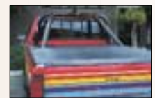
For a clean look, 3M™ Scotchmate™ Reclosable Hook and Loop Fasteners attach truck tonneau covers. Adhesive backing resists temperature variations and moisture.